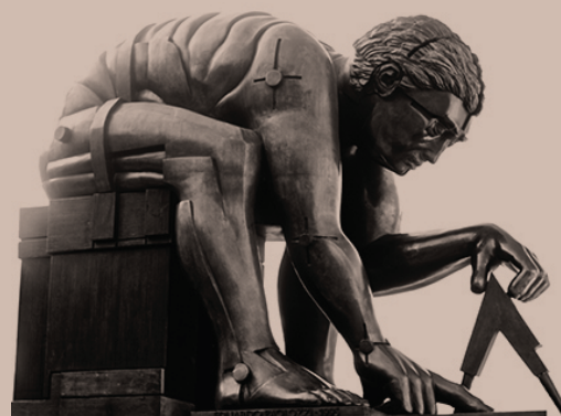
Newton by Eduardo Paolozzi, outside the British Library, London

BDS metadata also plays a significant role throughout the process of book selection and acquisition with wholesalers, library suppliers, system suppliers and all UK and Irish local library authorities. This generates a significant income stream for publishers.